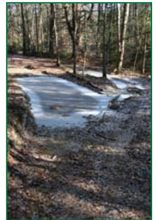
A damaged Forest Preserve trail due to ATV trespass.

The Council hired the Albany firm of Young/Sommer to defend the state’s right to keep closed abandoned town roads on Forest Preserve. In the most recent phase of the case involving the Jackrabbit Trail between Keene and Lake Placid, the state is being sued to open an abandoned road in the Sentinel Range Wilderness Area to motorized vehicles.