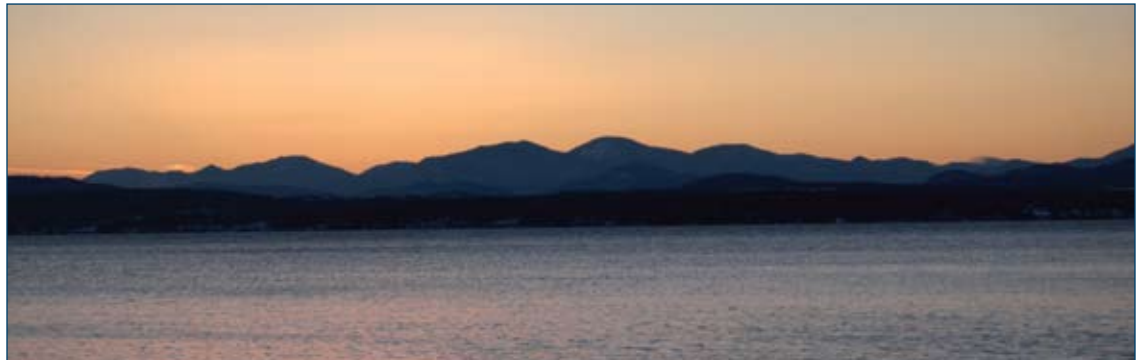
Lake Champlain and the Adirondacks from Vermont

We would also like to see additional staff and resources for APA and DEC. Due to a series of budget cuts, both agencies have lost close to 25 percent of their staff in the last two years and cannot meet their statutory requirements.