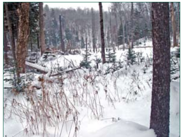
The Vanderwacker Wild Forest in the central Adirondacks contains sensitive habitat that will be disrupted by a new class of snowmobile trails.

The guidelines would create a new class of wider snowmobile trails known as "Community Connector" trails. Unfortunately, the guidelines violate the Adirondack Park State Land Master Plan (SLMP) by increasing trail width to 9 feet wide (12 feet in curves) and allowing mechanical groomers. The DEC's plan also fails to meet the goal, long supported by the Council, to remove snowmobile trails from the interior of the Forest Preserve and re-locate them along travel corridors between communities. The Adirondack Council has filed legal papers calling on the state to amend the SLMP before moving forward with the new snowmobile trail designation and grooming procedures.